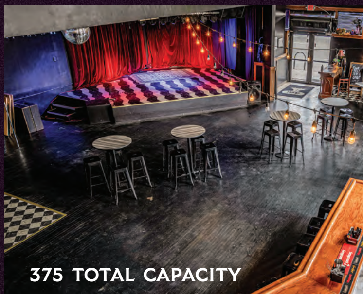
375 TOTAL CAPACITY