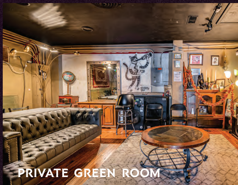
PRIVATE GREEN ROOM